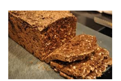
Rugbrød "Rye Bread"

See many more menu suggestions on our website WWW. Café Olai.dk